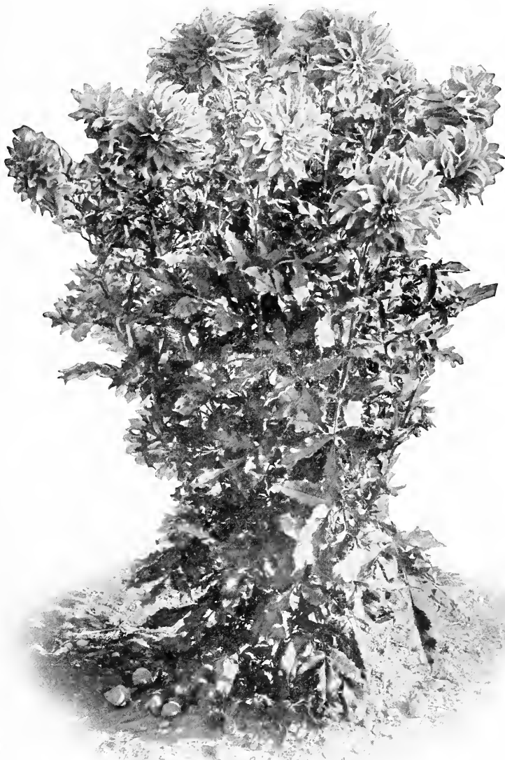
Plant of Rodman Wanamaker, height 6 feet. This plant had 13 flowers on stems 4 feet long.

Reference. Berlin National Bank, Berlin, N. J.